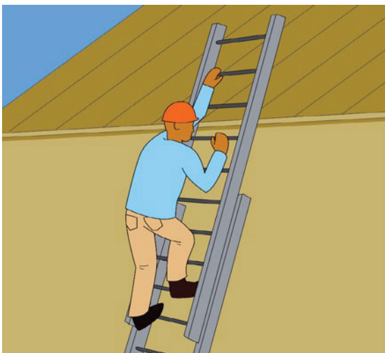
Figure 2: Ladder extending three feet above the landing area.