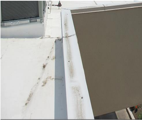
Top fastening of light weight metal edge (with no wood nailing support underneath) creates a low channel where water collects and then enters the building through the fastener holes.