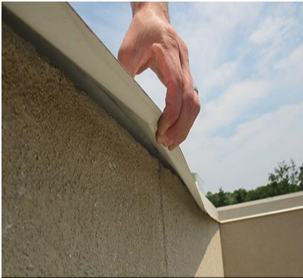
LIGHT GAUGE OR RESIDENTIAL METAL EDGING CAN EASILY BEND. THIS APPLICATION IS ALSO MISSING CONTINUOUS CLEATING.